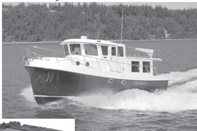
American Tug 41